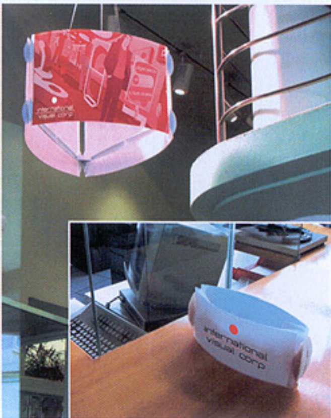
International Visual Corp.

Grottini S.R.L. (Porto Recanati, Italy) offers a range of products and integrated services for retailers. Capabilities include research, branding, design, manufacturing and architecture. [+071-7591707; fax: +071-9798626; e-mail: info@grottini.com; Internet: www.grottini.com]