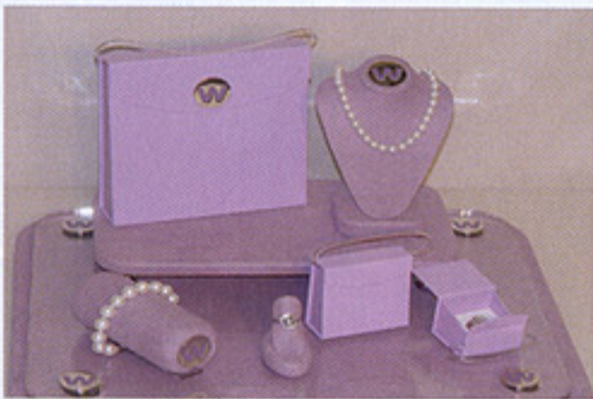
Warner Box & Display