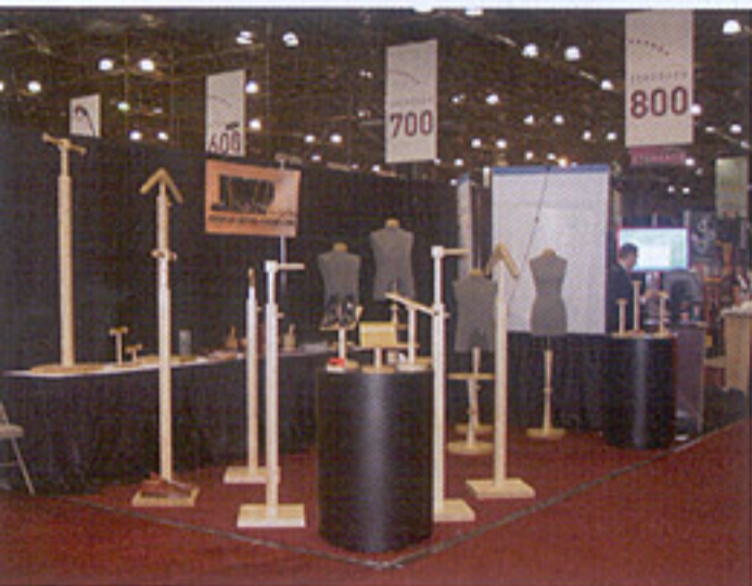
JMP Wood Fixtures