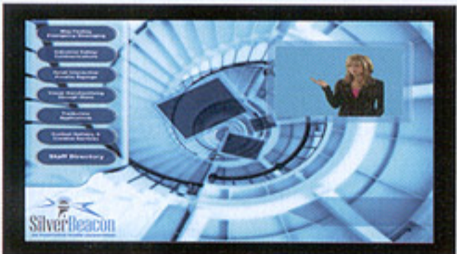
Silver Beacon Media