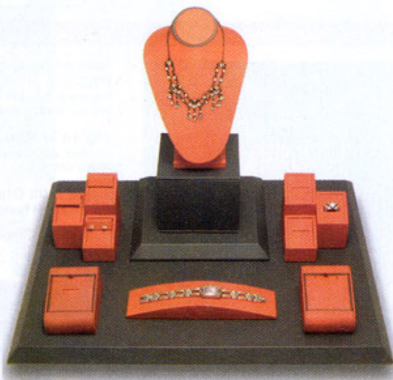
Warner Box & Display